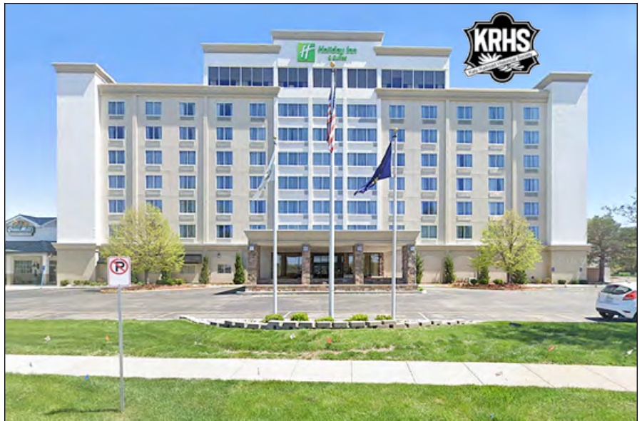
Holiday Inn & Suites-West in Overland Park, KS is our 2026 KRHS headquarters.

Six daily trains can take you to or from Kansas City for the KRHS convention. Visit https://www.amtrak.com/home.html to start planning your trip. Kansas City Union Station, where we will enjoy our Saturday evening May 2nd banquet, is exactly 13.0 miles via I-35 from our Holiday Inn Overland Park-West headquarters.