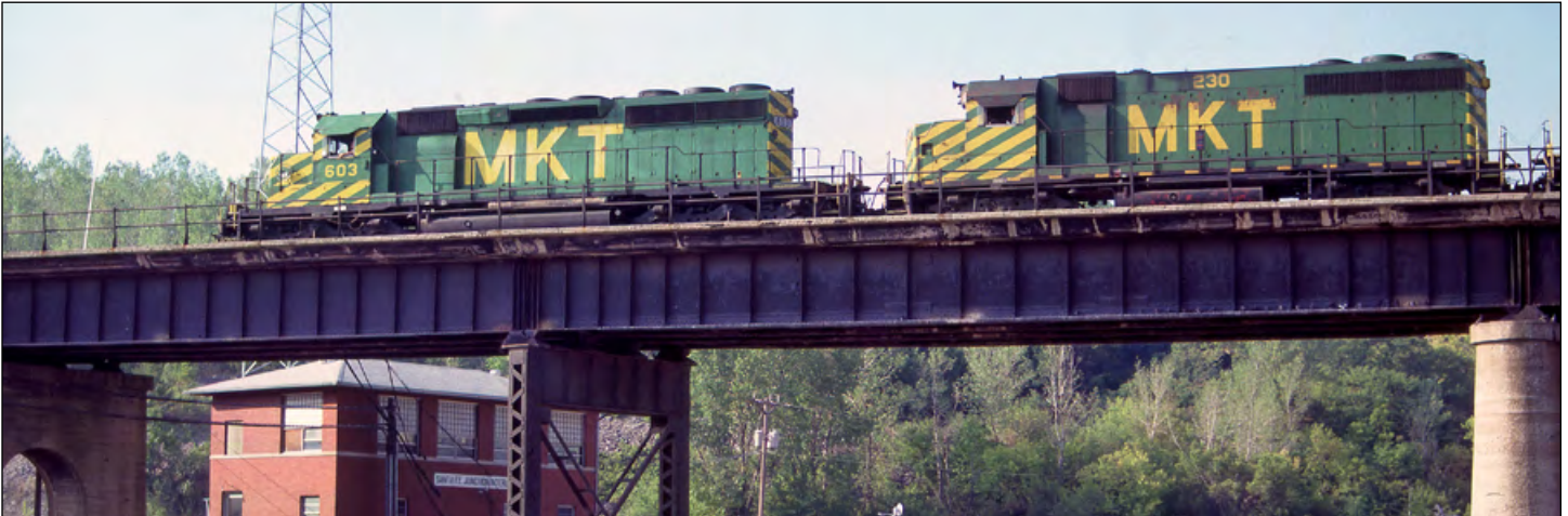
SD40-2 #603 and a GP40 were coming off the KC Terminal's Kaw River Bridge into Missouri at Santa Fe Junction on Sept. 11, 1987.