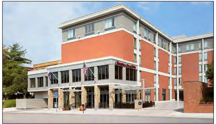
KRHS 2024 Hampton Inn Clayton/St. Louis convention headquarters.

I want to VOLUNTEER to help during the KRHS’ St. Louis, Convention. (THANK YOU!)