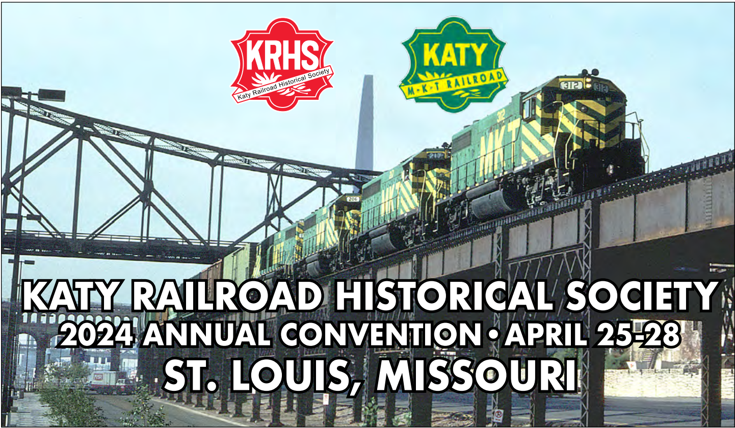
Northbound Katy No. 102 on the St. Louis Terminal Railroad Association's High Line on September 18, 1987.

From April 25 to 28, 2024, the Katy Railroad Historical Society's annual convention will again be in St. Louis, Missouri. Headquarters is the Hampton Inn & Suites, 215 Meramec Ave. in the business district of suburban Clayton, Missouri 63104 (see map). Book your room reservations online using our Group Code "KRH" at https://group.hamptoninn.com/47fh17 . Or call the Hampton Inn at 800-774-1500. A KRHS group rate of $126 per night (standard King or Double Queen) is guaranteed through April 4, 2024. Make your reservations EARLY.